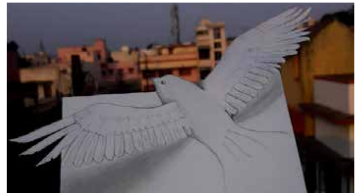
3D art by Sreyashi Dutta, BBA III