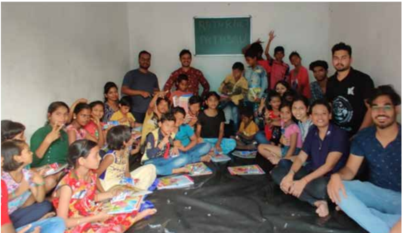
KSOM students spend quality time with kids