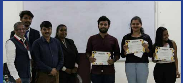
B-Fest "ORION", organized at SRI SRI University