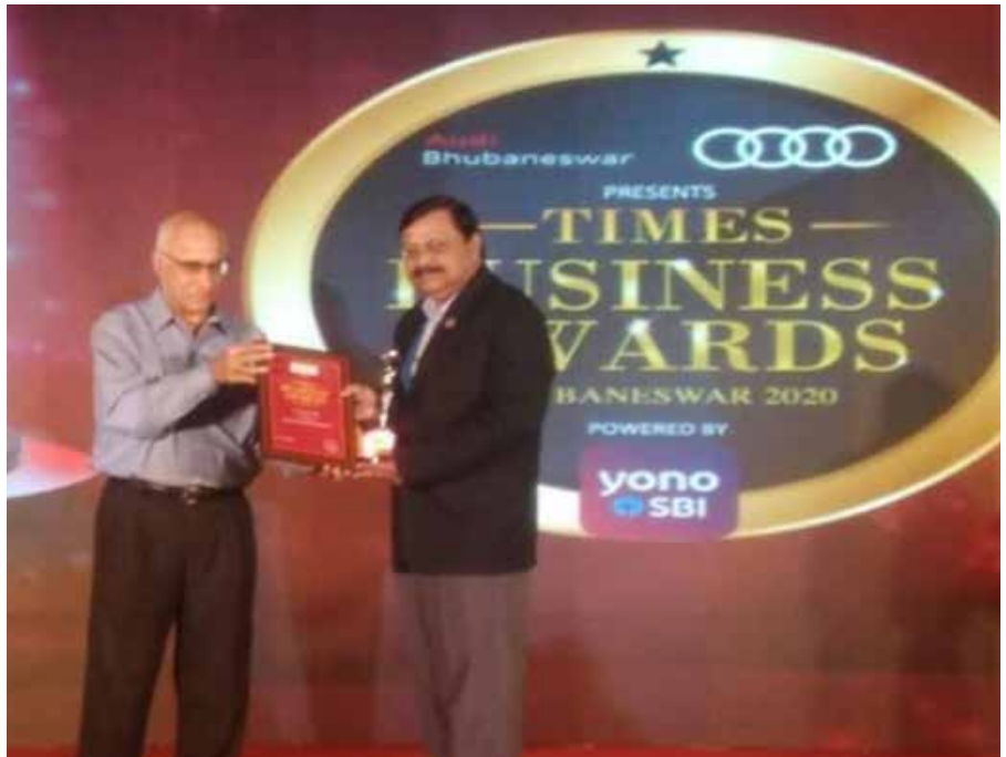
KSOM bags best B school award