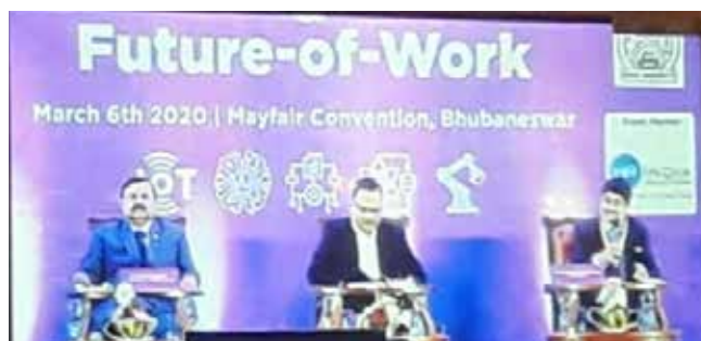
KSOM Director addresses on Future of Work

The Conclave was attended by more than 200 corporate delegates, and students from eminent management schools.