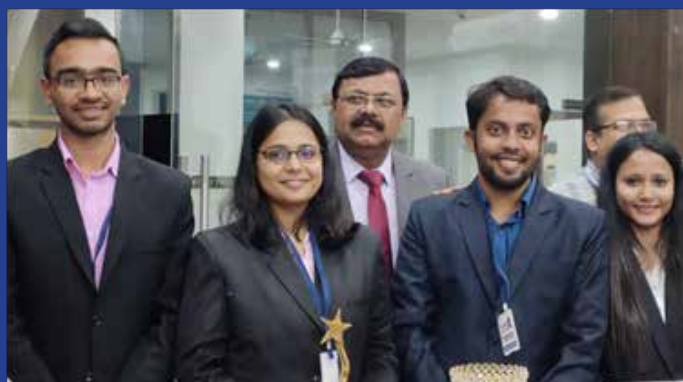
KSOM Students who participated at ZENITH Reward and Recognition Program