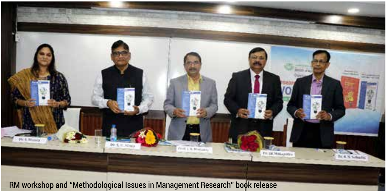
RM workshop and “Methodological Issues in Management Research” book release