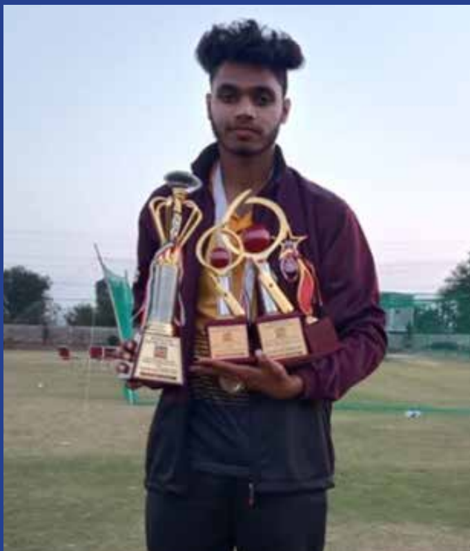
All India VPL4 (Vijayvargiya Premier League)