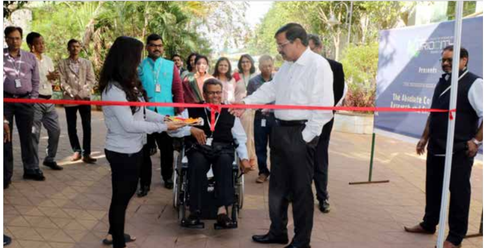
Student volunteer team working and managing stalls at Kuriocity 2.0

Kuriocity 2.0, the KSOM Research fair, witnessed close to 2000 participants from Schools, B-Schools like BIITM & SSU, and Technical Schools like ITER and IIIT. The games' stalls were sponsored by ACER, Zomato, White Edge Pvt. Ltd., Ferns & Petals and My focus (9c Technology Labs Pvt. Ltd.)