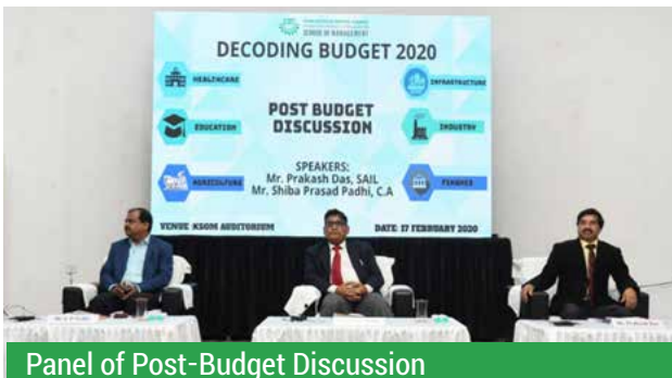
Panel of Post-Budget Discussion