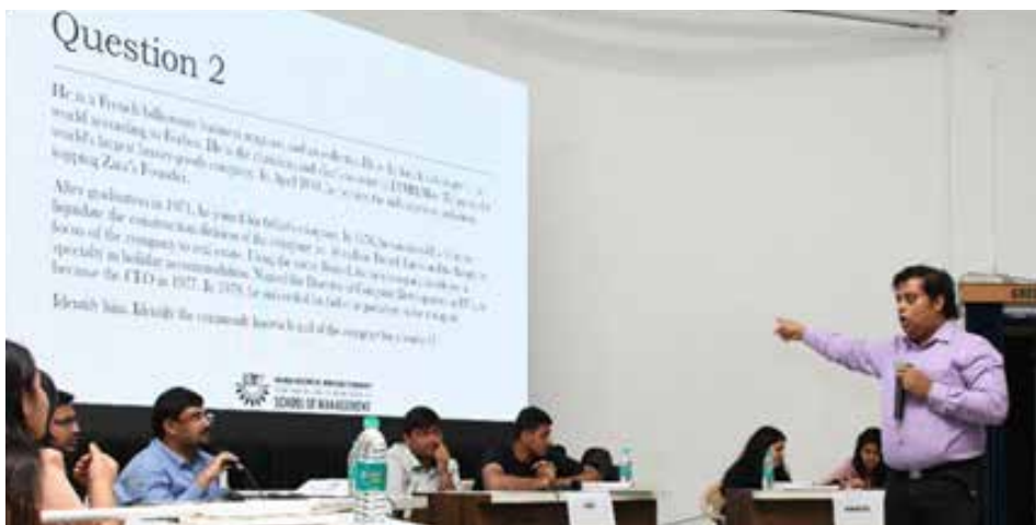
Business Quiz competition in session during Kolosseum