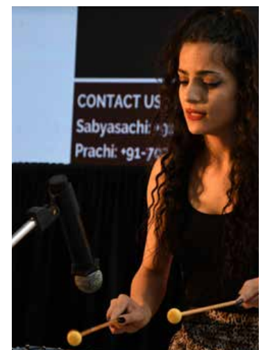
International student of KSOM displaying her talent during Kolosseum