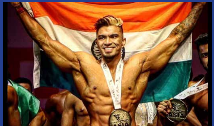
Mr. Muscle Mania Asia (Men's Physique)