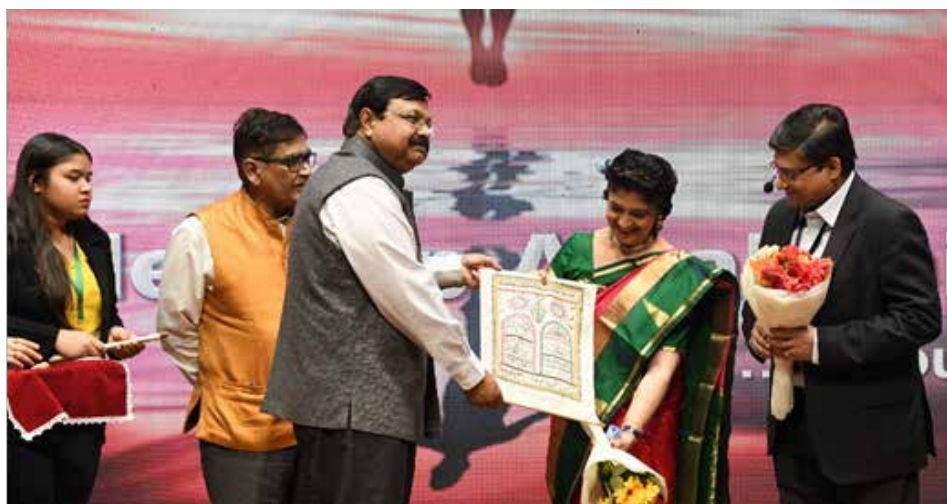
Corporate Musical event during Kolosseum