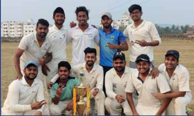
KSOM students in the KIIT Team that emerged winner at GIET, Bhubaneswar