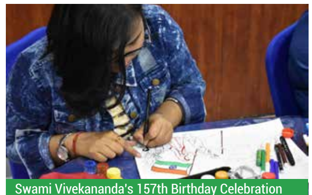
Swami Vivekananda's 157th Birthday Celebration